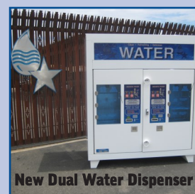
New Dual Water Dispenser

Over the years, the water machine located in front of the Entranosa office has been very popular with customers. In fact it has been so popular, customers have had to wait for a turn to refill their bottles. At the Board of Directors annual budget meeting, the Board approved the purchase of a dual machine to improve service. Entranosa will be relocating the existing machine to a location next to Highway 14. When we have a firm location, we will announce it in the newsletter.