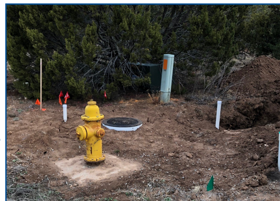
A small tractor makes work easier in neighborhoods

efficiently in these tight areas and save time on labor. This tractor is used but still in great shape and will serve Entranosa members for years to come.