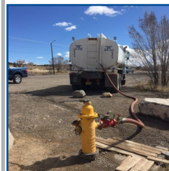
Hauler fills his tank

Entranosa Water & Wastewater provides a valuable service to residents of the East Mountains. Entranosa sells more than 750,000 gallons a month in bulk water sales to local water haulers. That total also includes sales to individuals through our bulk water machine on Highway 344 and Frost Road. Without Entranosa, those families might be high and dry.