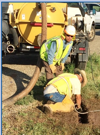
Marking the existing line to install new 16-inch water line

Entranosa Water & Wastewater is starting work on a new 16-inch water line and larger booster pumps to increase flows to the Paa-Ko subdivision and golf course. The golf course has its own water rights and well. Entranosa has an agreement to transport water from that well to the golf course, so no residential water is used to irrigate the golf course. The new line is being funded by Mountain Ranch, Ltd., the developer of the Paa-Ko subdivision and will greatly improve water delivery to the Paa-Ko subdivision and golf course. Construction on the new approximately three-mile line should start in September and be completed by the end of the year.