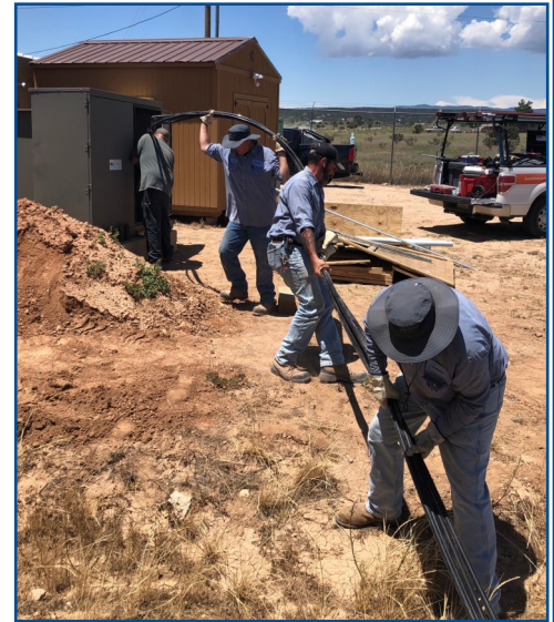
Field Crew Pulls Line—Literally

years, the main booster station adjacent to Nugent Road did not have a main power disconnect. This month -- after lots of permit challenges and help from Central NM Electric Cooperative -- the new disconnect was finally installed. It entailed a full day with lots of manpower to pull the new line. Improvements to this facility is critical as Entranosa continues to work through the details of offsetting the $140,000 annual power bill with a solar array.