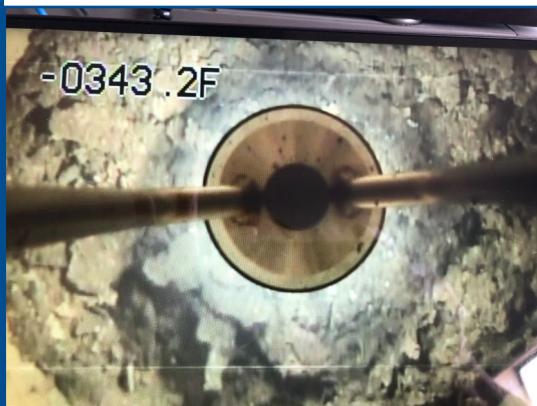
The well bottom at a depth of 343.2 feet

irrigation pump motor and pull the turbine pump. The next step was to do a full inspection by camera. This