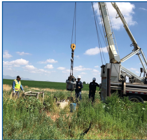
Entranosa crews pull the irrigation pump

In April, Entranosa purchased a new well called "Pine Canyon East." Prior to development of the well, Entranosa had to wait until July for the alfalfa crop to be harvested. After the harvest, the first step was to remove the