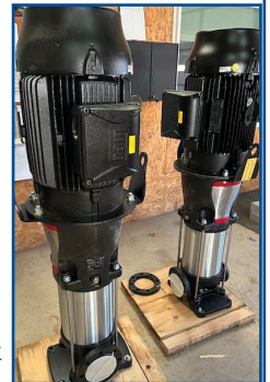
For Nugent Booster

critical but it's also expensive. These new state-of-the-art upgrades to the Nugent booster station cost $25,000. • Two new submersible well motors are ready to be installed for this year's pumping season.