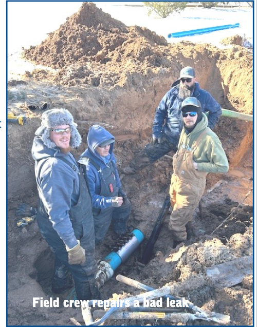
Field crew repairs a bad leak

The West Hill Ranch Road leak took 24 hours to repair and to refill the distribution system and the 100,000-gallon Hill Tank. The main line break was in a difficult location, which caused more than 500 homes to lose water. Even though this was a difficult leak, it clearly pointed out areas of improvement Entranosa needs to fix to lessen the number of homes affected for future service outages.