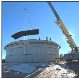
Crane lowers roof panel

tank's roof, starting with the installation of support slats. Next the roof was installed piece by piece over the supports. A crane lowered the roof panels so the construction crew could weld the panels together.