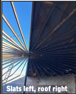
Slats left, roof right

tank's roof, starting with the installation of support slats. Next the roof was installed piece by piece over the supports. A crane lowered the roof panels so the construction crew could weld the panels together.