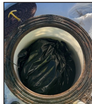
Insulation protects meter