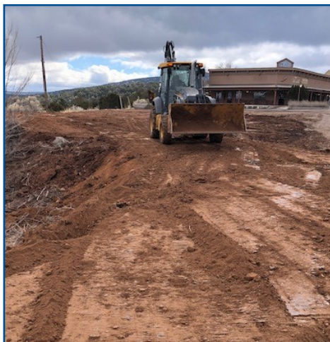
An earth moving crew clears the site of a new water line. The Lazy Lizard shown in the background; left, the prepared site.

main to accommodate the new N14 roundabout. All utilities, including Entranosa, must have their work completed by March 30, as the major part of the build begins April 1, 2024. Star Paving was awarded the $9 million contract and has 440 days to complete the work. The relocation of the waterline will cost the association over $200,000 with no reimbursement from the state. This project was awarded in 2023 from Capital Outlay budget, but was later determined to be ineligible due to the lack of legislation for CA 2.