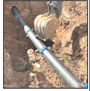
Digging out the site

An Entranosa field crew replaced an old leaky water line under Interstate 40. However, before the new line could be installed, we had to clean and inspect the steel casing.