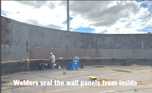
Welders seal the wall panels from inside

FHG's tank contractor gets started erecting the walls of Entranosa's one-million gallon water storage tank. In December, Board of