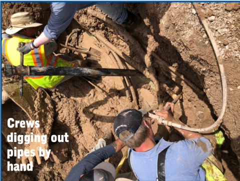
Crews digging out pipes by hand

As always, Rairdance Drive offers continuing challenges. In Paa-Ko Communities, the Rairdance Drive utilities were constructed in solid rock. Because of the high costs of