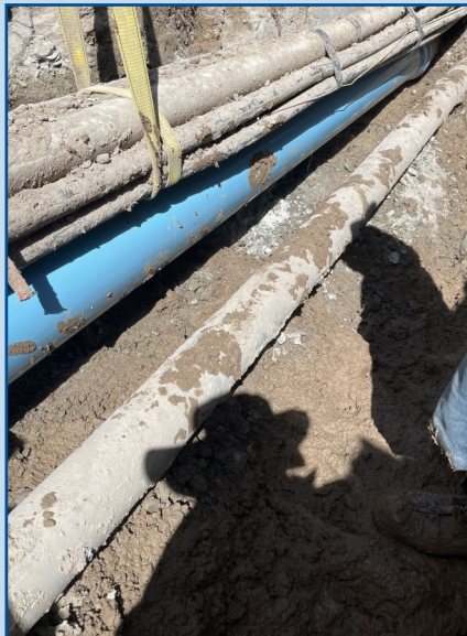
Hydro-Excavator clears pipes but is messy work

trenching, the developer put all utilities in a common trench, with water pipes on the bottom. In the past couple of weeks, Entranosa's crew had two leaks which required hand-digging and a hydro-excavator to remove all material on top of all the utilities before the repair could begin on the water line. Entranosa now has a policy of not sharing the same ditch with other utilities.