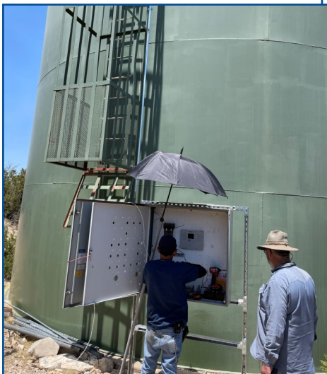
Crews bring Hill Tank online

Hill tank is a 24-foot 100,000 gallon tank that supports the Hill Ranch Road area. Hill tank is finally getting connected to mission control system, which will monitor flows and water level inside the tank.