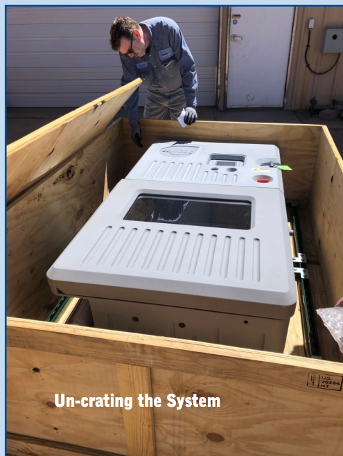
Un-crating the System

manufactured in Albuquerque. The Labs used Entranosa as a beta test site with one of the first units produced. The system is safe for operators, is cost effective and better controls the proper amount of disinfection without excessive treatment that can impact the taste of the water. The company has been sold several times and is now owned by De Nora, a global company with over 95 years of expertise in electrolysis/ electrochemical technologies.