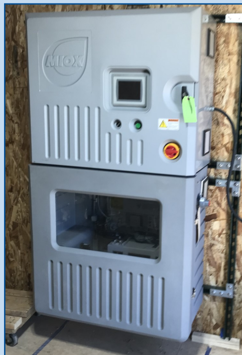
New fourth-generation Miox for water disinfection