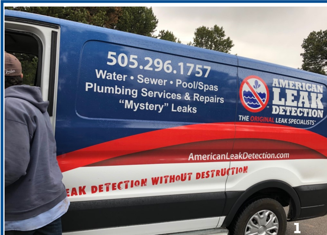
1 — Albuquerque-based American Leak Detection arrives at the home