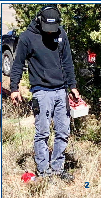
2 — Using specialized headphones, the technician listens for the sound of a leak