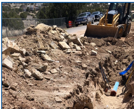
Rock Hammer Needed

This photo is a classic example of why Entranosa has a "rock clause" in every line extension agreement. No matter how many test holes you dig, there are always surprises. Nice easy digging can turn very quickly into expensive rock removal.