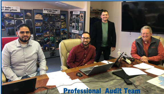
Professional Audit Team

assisting as they ask questions and test the accuracy of financials and our internal controls.