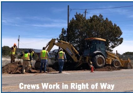
Crews Work in Right of Way

new right-of-way agreement. After more than 10 years of discussion and negotiation, Entranosa and the County reached a reasonable right-of-way use fee that will not be passed on to the membership.