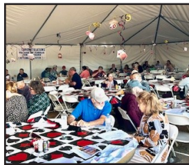
2025 Meeting at Entranosa

At the April Board meeting, the Entranosa Board of Directors set the date of the Annual Meeting for September 26, 2026. There will be three Director positions open along with Bylaw amendments to be voted on. Entranosa staff is planning the venue and food. Details to come in future newsletters.