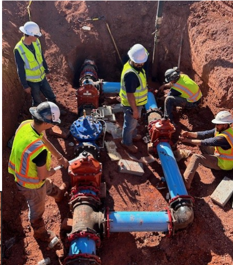
Failed valve, left; Replacing valve above

Entranosa has done extensive work off Frost Road because a mainline valve failed. For weeks, operators were forced to use a pipe wrench to adjust water flows to the Paa-Ko tank farm, which provides water to Paa-Ko and N-14, Frost Road and