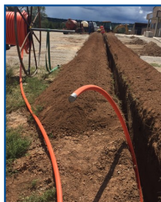
Fiber Optic Cable

Entranosa Water & Wastewater Association Office: (505) 281-8700