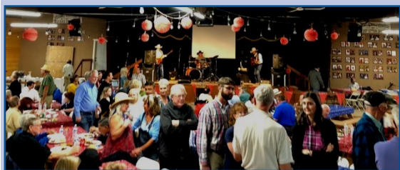
Members queue up for barbecue from Ribs

On Sept. 20, more than 200 Entranosa Water & Wastewater members attended the 2018 Annual Meeting at Founders Ranch. The event featured the Cowboy band, Ribs barbecue and a tasting