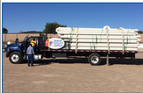
Delivering pipe to connect new members