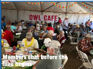
Members chat before the luau begins