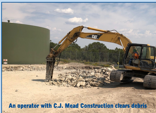
An operator with C.J. Mead Construction clears debris

Excavation starts for a new 500,000-gallon storage tank. FHG Inc. of Mint Hill, NC was awarded the contract to build the tank. Tank construction should start this month and be completed early next year. The Entranosa Board decided to use some cash reserves to address periodic water storage shortages that were experienced during last July's hot, dry spell.