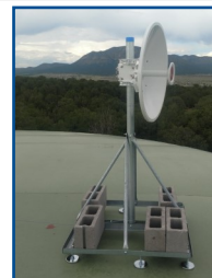
Wireless installation from Lobo Internet

In June, Entranosa asked for RFPs to lease telecommunications stations on our 15 tanks. Lobo Internet Services was selected. Installation improves wireless internet connectivity service in the East Mountains.