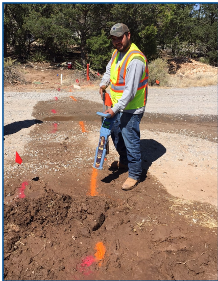
An operator marks a recent project

New Mexico One Call is non-profit organization serving the state of New Mexico. When New Mexico One Call was founded in 1988 by federal law, there were eight separate one call centers operating in the state. The state's largest utility formed a committee to discuss the need for a statewide one-call system. In 1999, NMOC opened covering Albuquerque; two months later it expanded and now covers all 33 counties. When a homeowner or contractor is planning a project, it's required that the person doing the work contact NMOC before work begins. A One Call operator will mark all lines within a few days of your call or online request. The numbers are 811, 505-260-1990 or 800-321-2537. The web address is nm811.org .