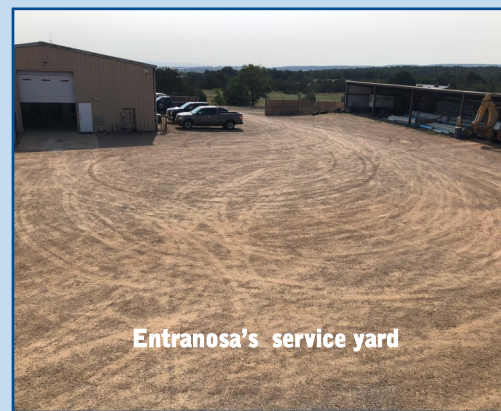
Entranosa's service yard

At the August 20 th Board of Directors meeting, the Board approved the date and structure of the annual meeting,