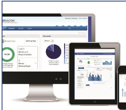
A simple monitor allows a home owner to monitor water usage 24/7

For the month of September, average household water usage in the Entranosa Water & Wastewater system was 8,500 gallons. If your water usage has been substantially higher than that, you may have a leak. According to the New Mexico State Engineer, a leak the size of pinprick can result in a water loss of 120 gallons a day or 3,600 gallons a month. A larger leak, say the size of a pencil eraser, can waste 448,560 gallons a month. This represents a huge waste of precious resources and money. If you suspect a leak, immediately call Entranosa